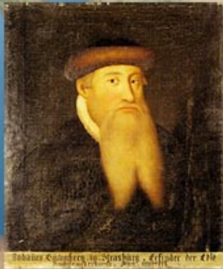
Johannes Gutenberg in Mainz, c. 1474